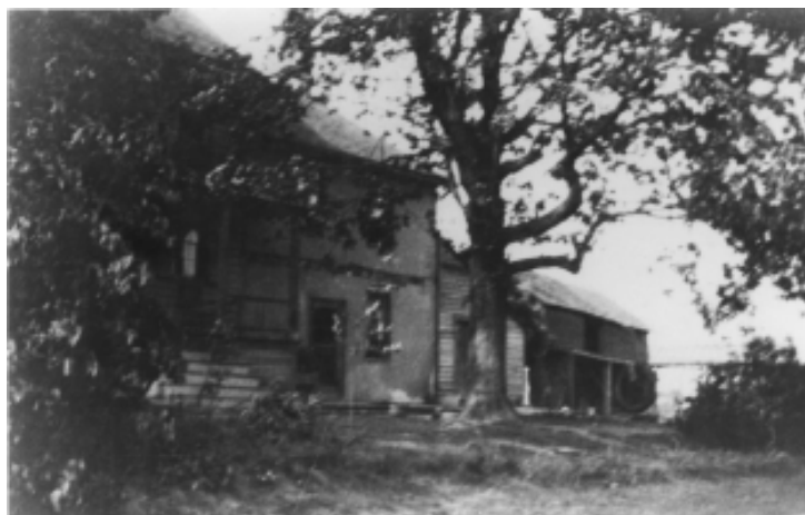
Andrew's Tavern (on our tour)